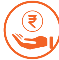
Value for money