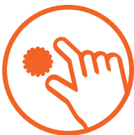
Remote control (optional)