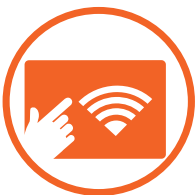
Wireless remote control panel (optional)