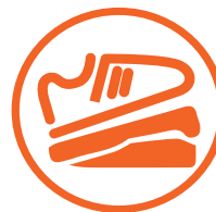
Foot pedal control (optional)