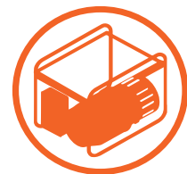
Suitable for use with power generators